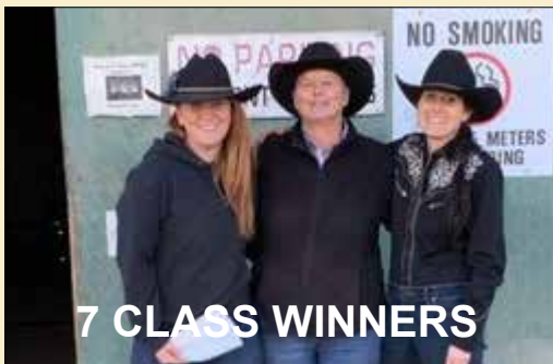
7 CLASS WINNERS