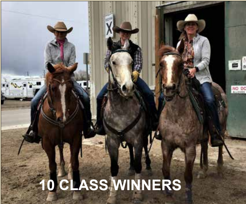
10 CLASS WINNERS