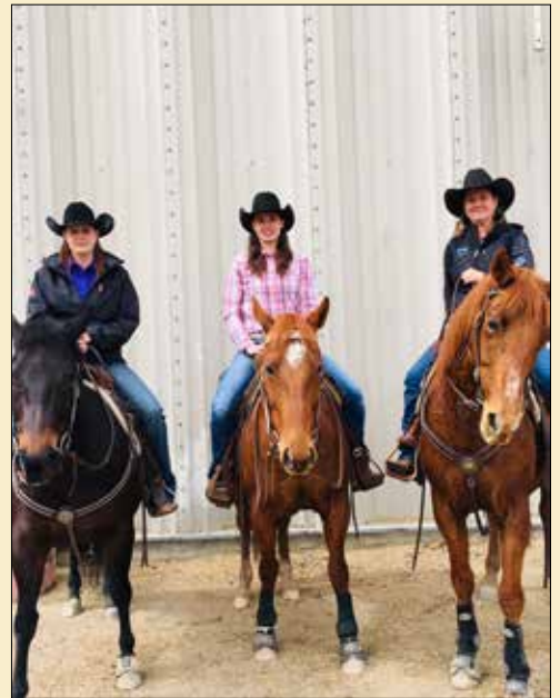
10 CLASS WINNERS