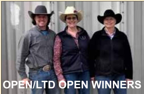
OPEN/LTD OPEN WINNERS